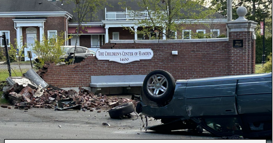
Photo of vehicle that impacted and severely damaged the entrance wall at The Children's Center of Hamden (2023)